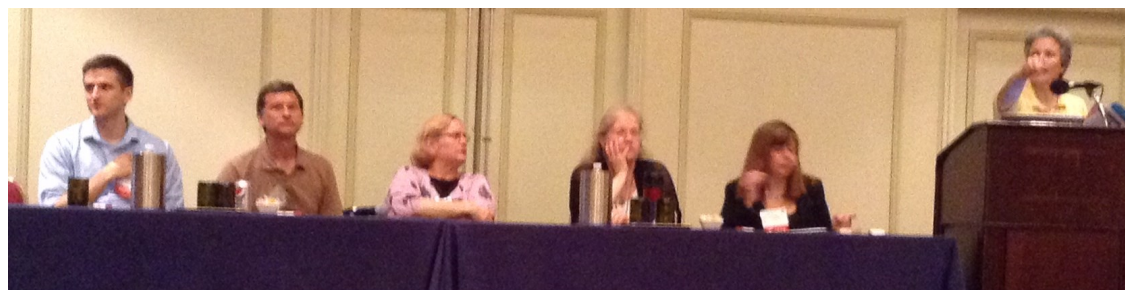
Friday FOD session Professional Panel