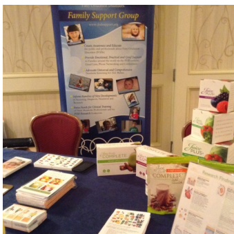
FOD Banner and Brenda's JuicePlus display