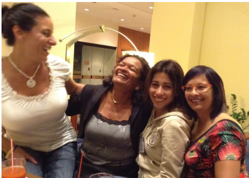
Goodtime Downtime after full day session